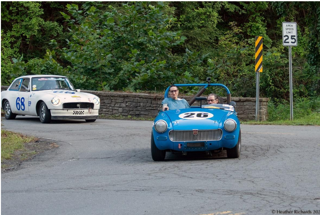
Larry Smith. Crew person Laurel hangs on.

One big feature of the Glen Vintage weekend is the re-enactment of the old course. Race cars get to drive the original Glen 6.2 mile circuit at controlled speeds.