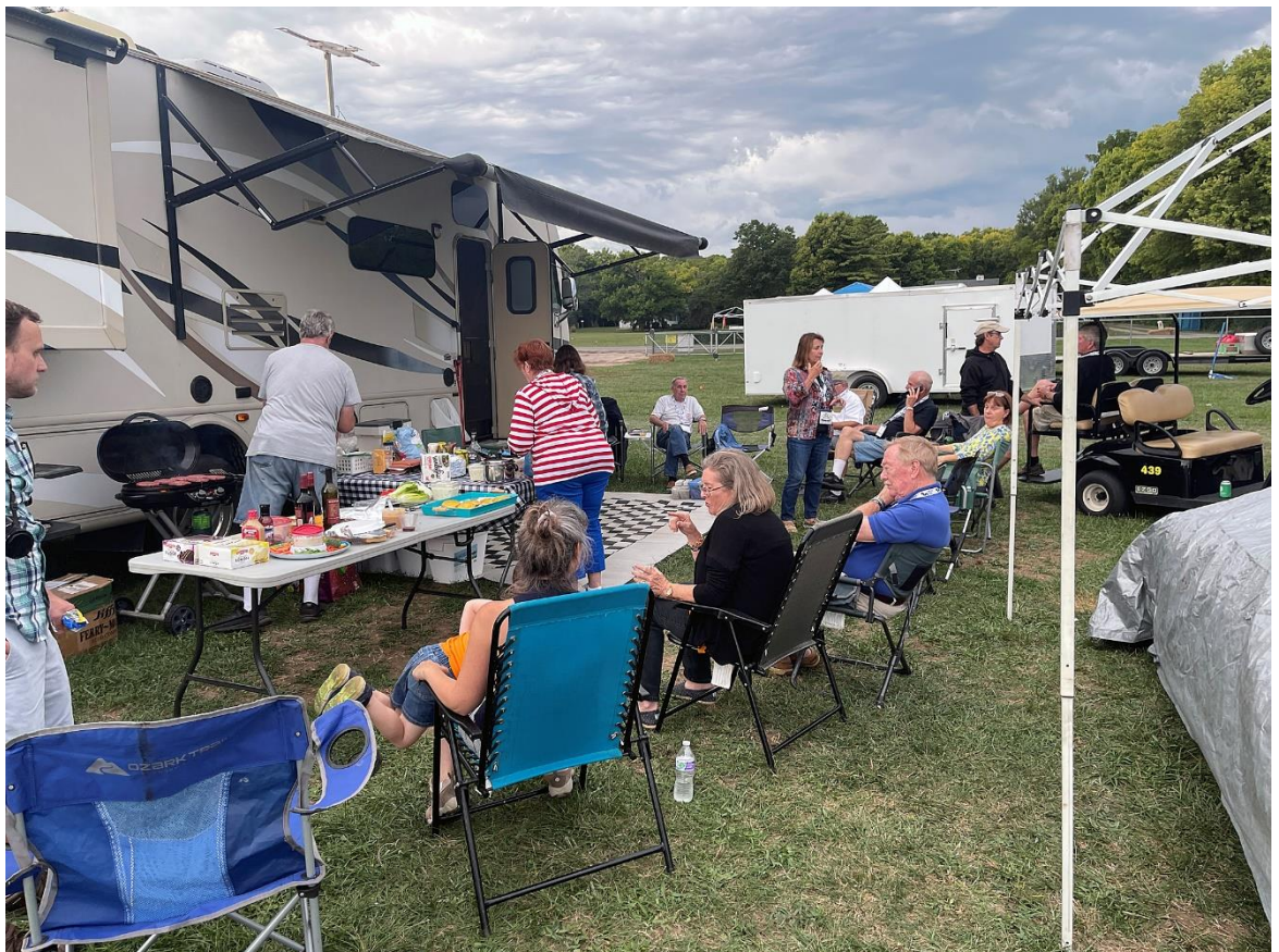
MG Central. The grille is cookin' & the folks are enjoying the day