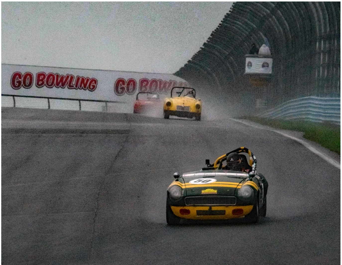
Andy Moore leads going into the second lap and never looked back