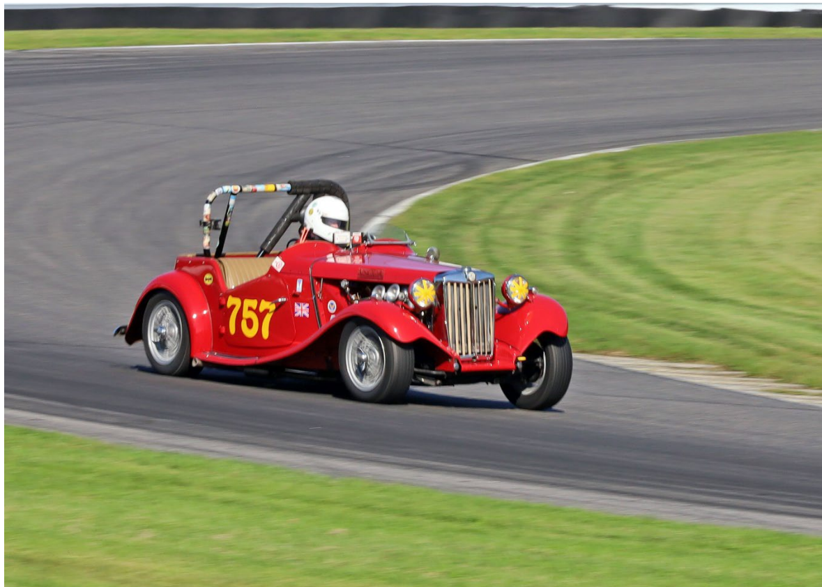
Aussie Graham Scaife was incredibly quick in #757 MG TD