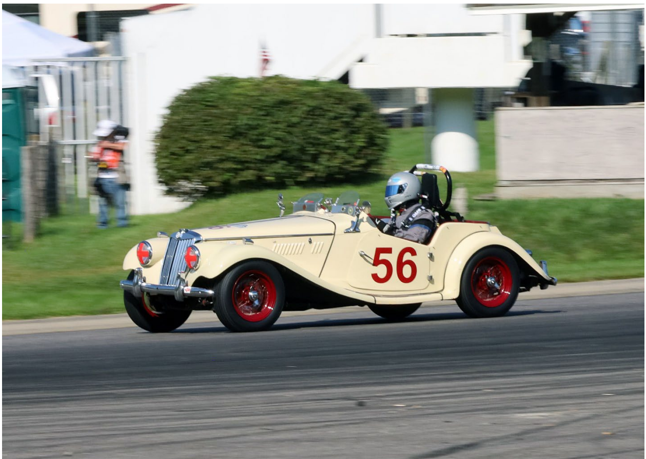
Glen Moore's TF all the way from Florida. It's fast and is available