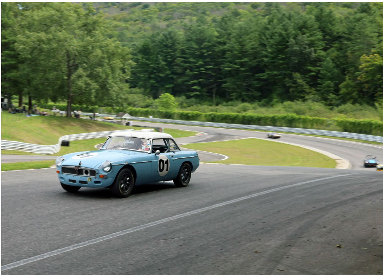
Alan Tosler's MGB finished #1 as well as wearing it on the car