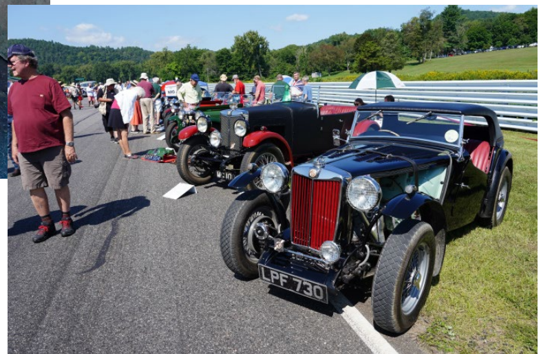
An amazing number of pre war and T's were on display