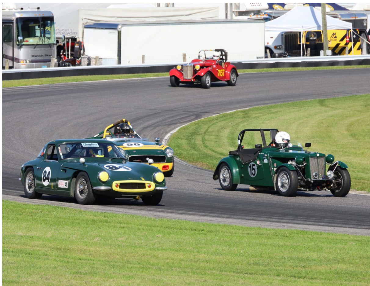
A TVR #84 with MG running gear raced, here being eaten by real MG's