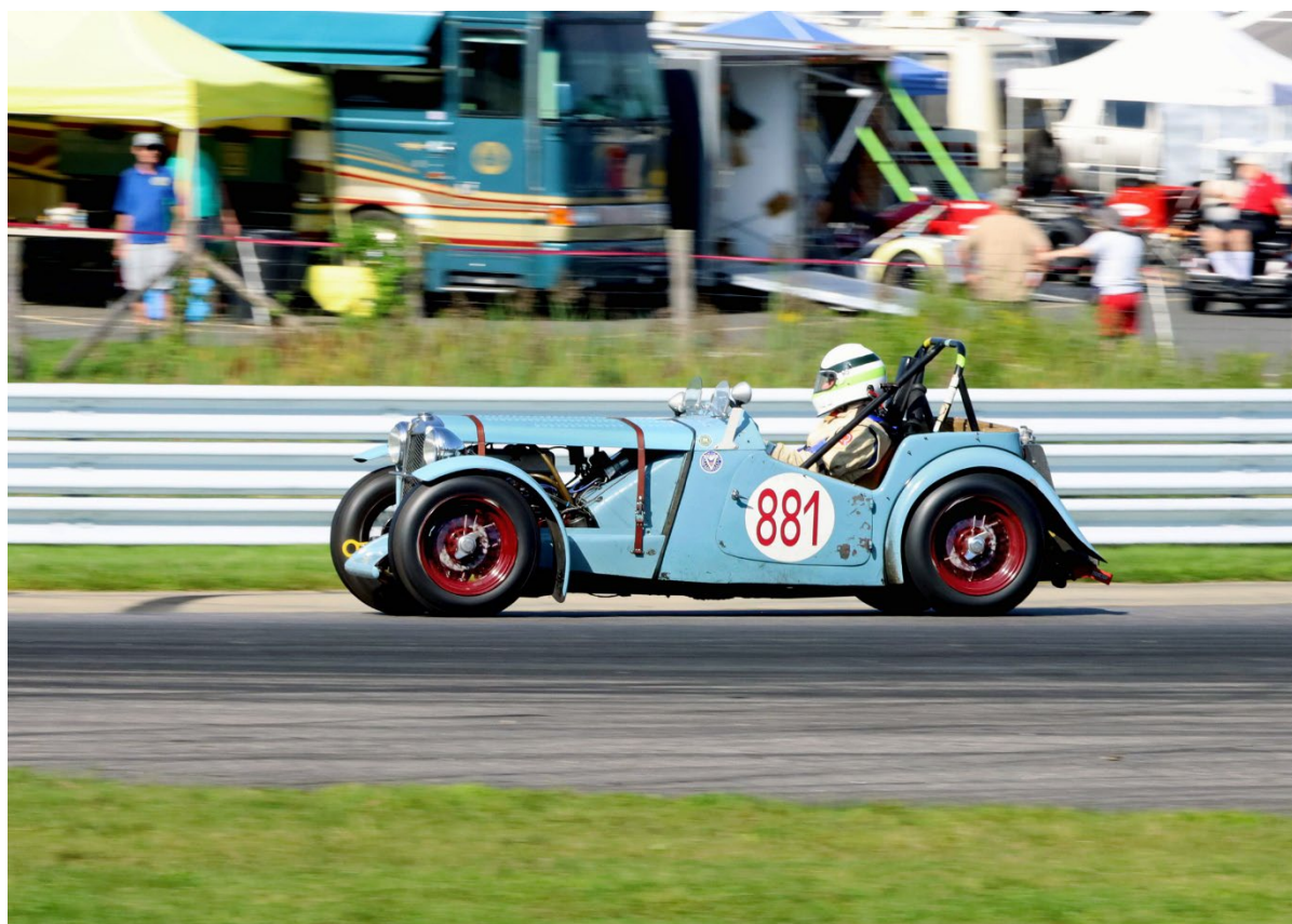
Russell Lane in #881 MG TC came in from Colorado