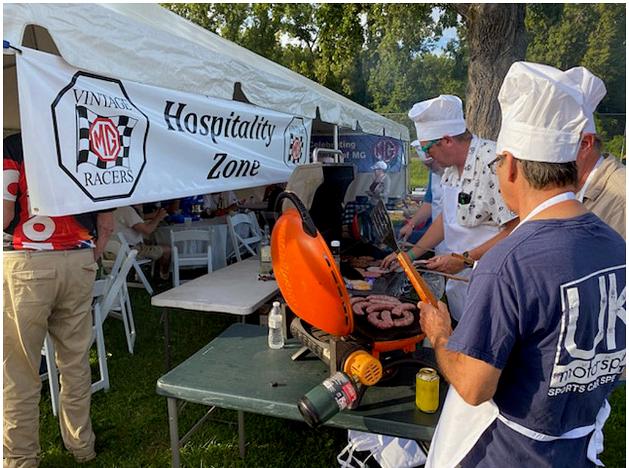
The brats and chicken are grillin'