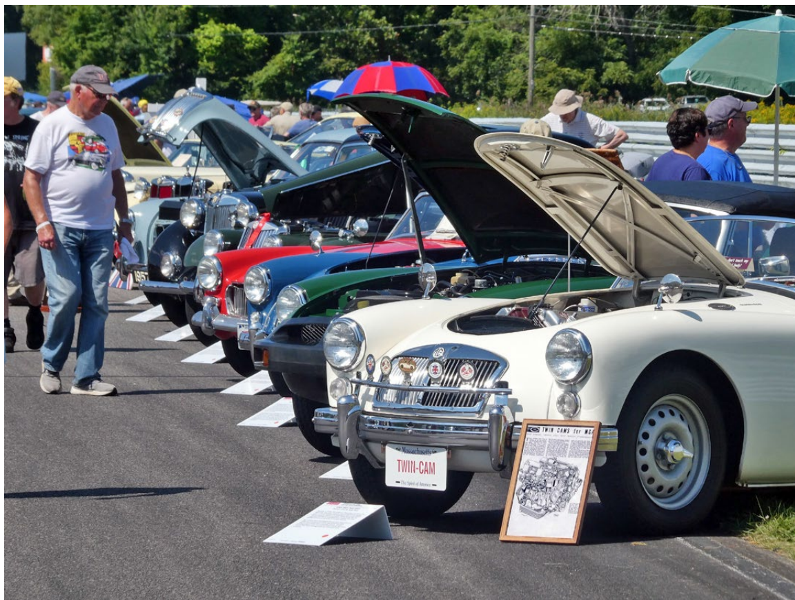
MG's lined up for judging