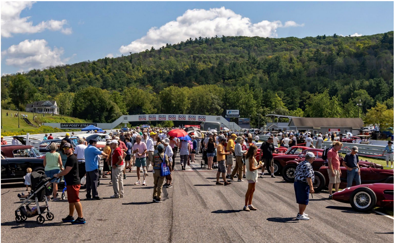
The Sunday in the Park Concours was splendid