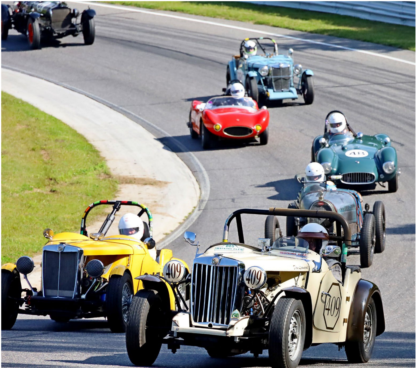
MGVR 100 th at LIME ROCK