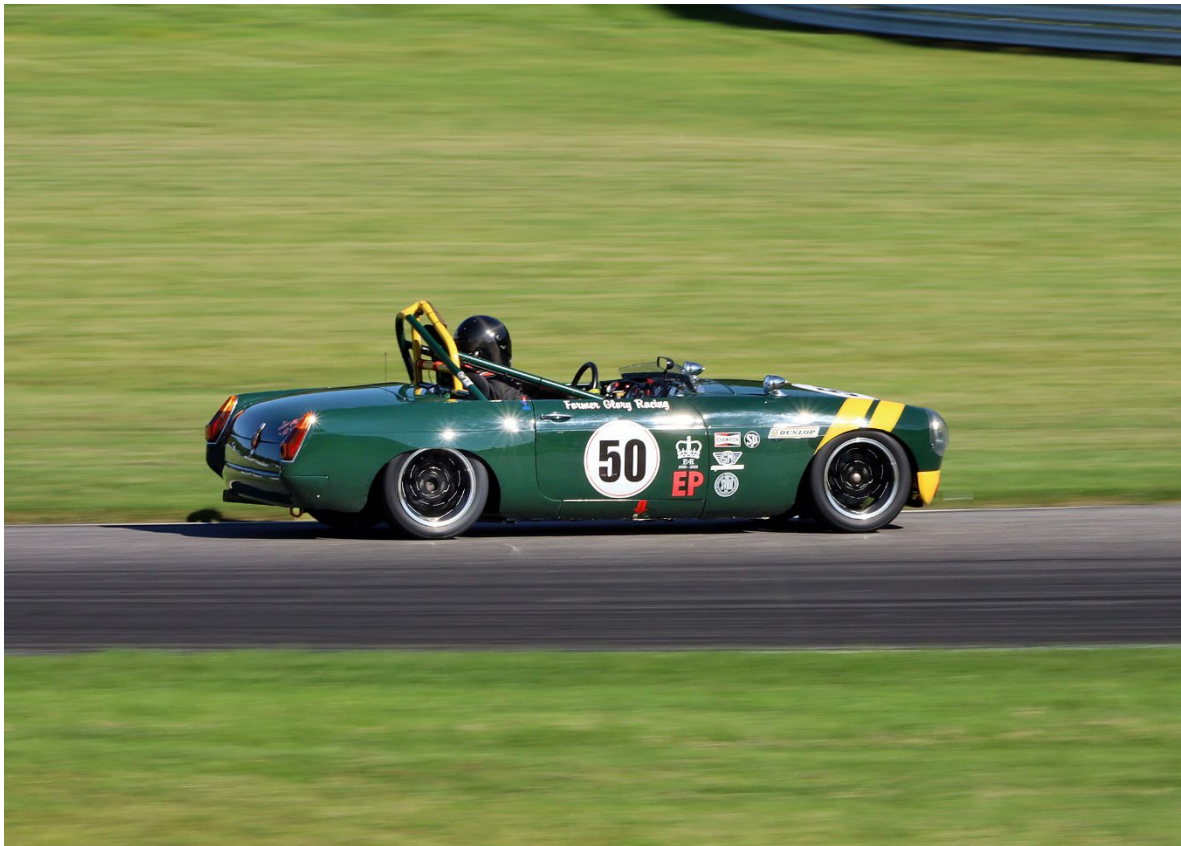
Anrew Moore's very fast MGB #50