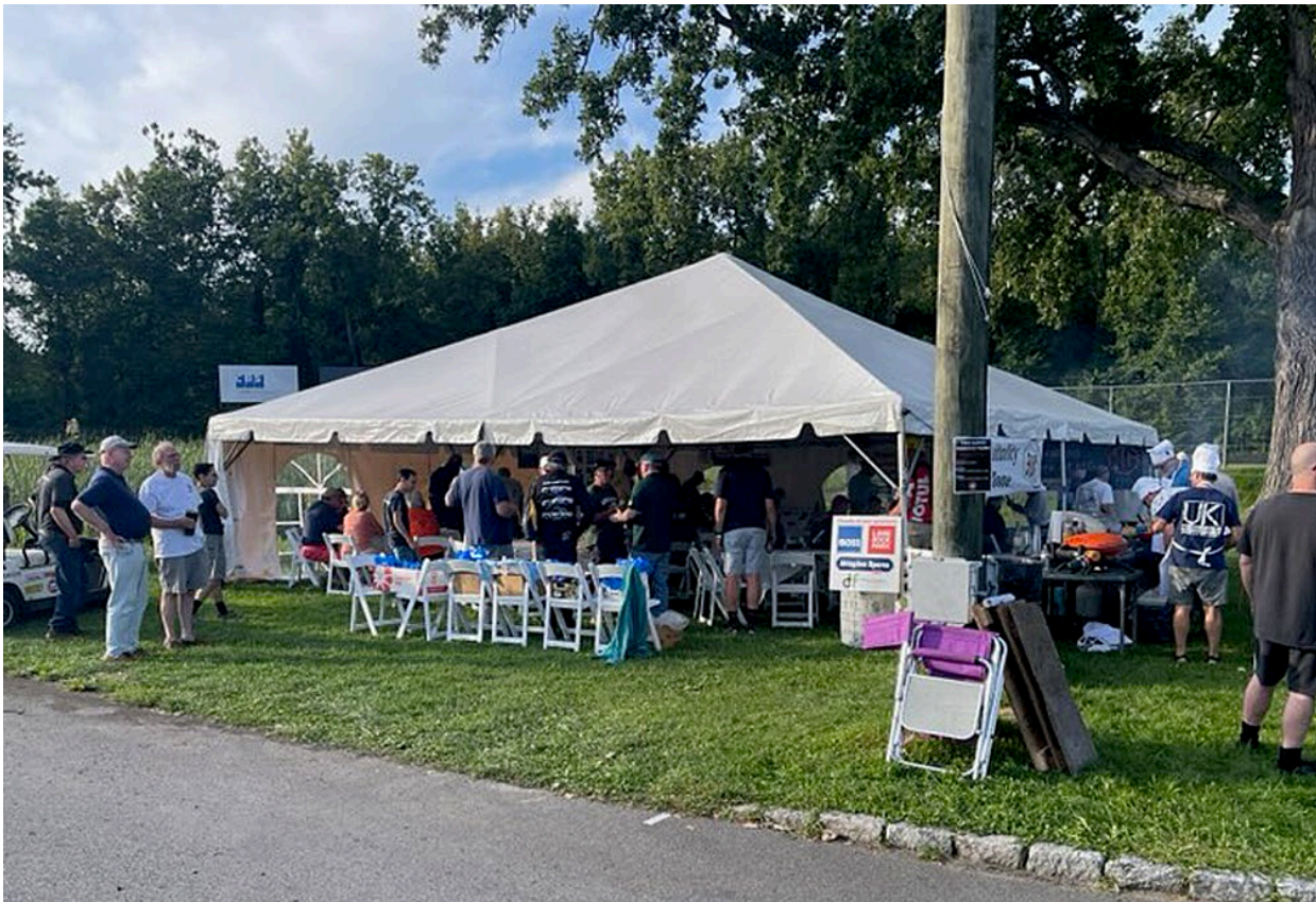
Arrival at the MGVR hospitality zone as the cooks start the fires